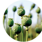
Opium dry extract and tincture