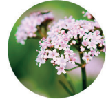
Valerian liquid extract